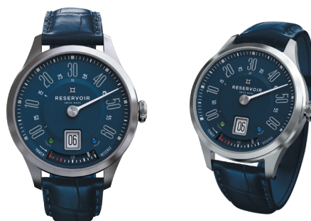
Longbridge Nightfall 16 300€* Ø 41,5mm Ref : RSV01.LB/730-36

This is when the new Longbridge Nightfall stands out with its rare materials. It inspires the most wondrous voyages, combining the midnight blue of an alligator strap with the silvery white of palladium, a rare metal of ever-increasing value, discovered in 1803 by a British physicist. A reflection of oneself, the Longbridge Nightfall shines with simplicity and intensity and expands into new frontiers with its 41 mm case. Embodying the English luxury and urban chic of the collection, this model possesses the fervour found between fantasy and reality.