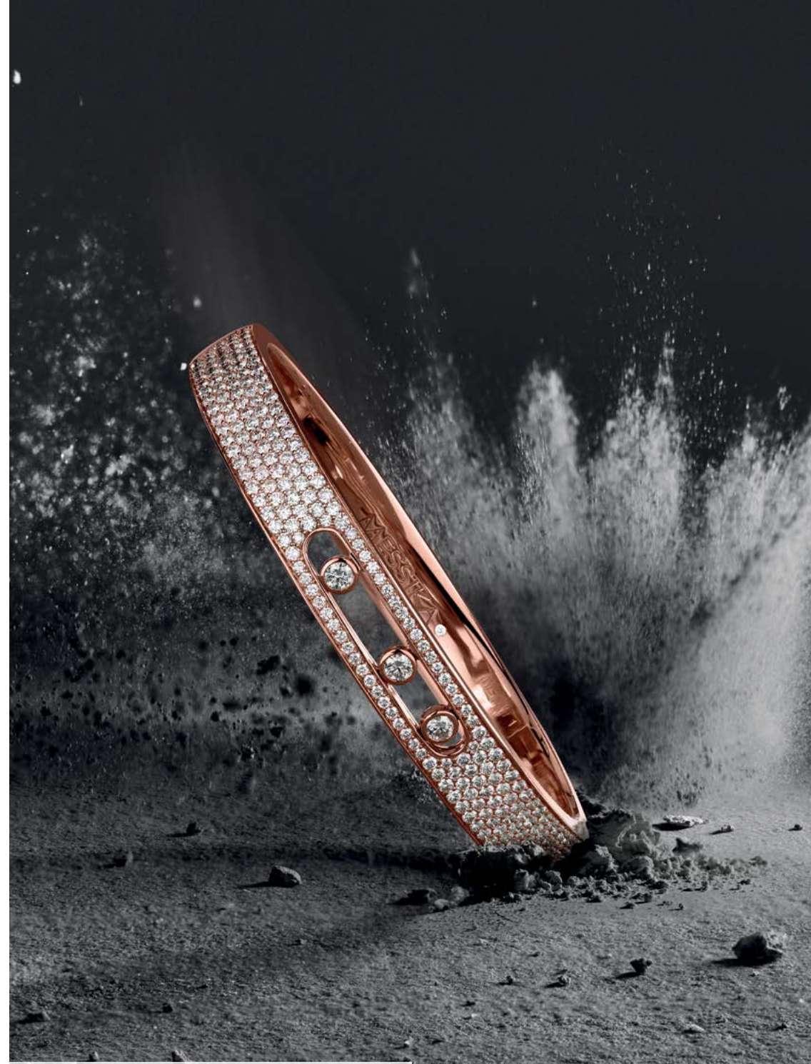
Move Joaillerie bangle – Gold and diamonds (3.40ct)

The Move Joaillerie collection has taken the Move concept to a new level in a shower of diamonds and signature designs, like the Move bangle with an entirely pavé setting.