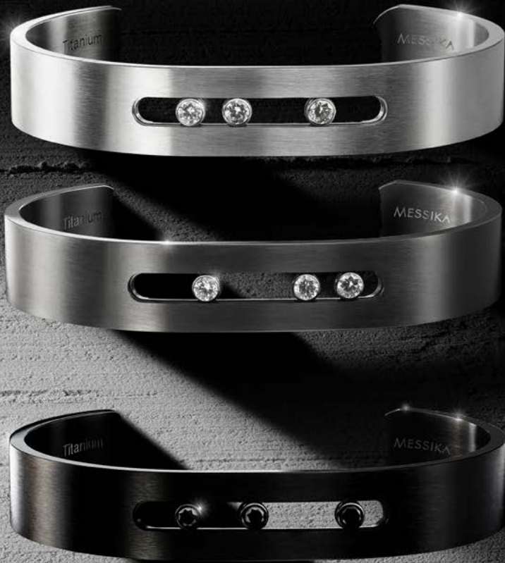
Move Titanium bracelets – Titanium and diamonds

To accentuate its contrasts, the Maison has designed three rings and three bangles that combine the robustness of titanium and the power of the diamond. And because all Valérie Messika's creations focus on lightness, not a single piece of jewelry weighs more than a few grams. The principle of the liberated diamond naturally forms an integral part of these creations, presented in three essential finishes that will complement men's looks every day.